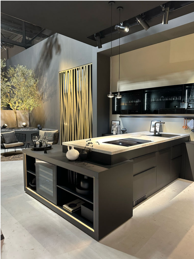
Picture 1: SMART metallic carbon with subtle insights and views through the exterior façade